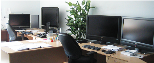
IDS Wiring facility, Sherwood Park, AB

In an age where contractors are becoming increasingly the standard on industrial work sites, document control is more critical than ever. With many hands requiring access to various critical documents, IDS strives for software solutions that help ease, organize, and maintain this documentation, which ultimately reduces overall cost of maintenance and projects.