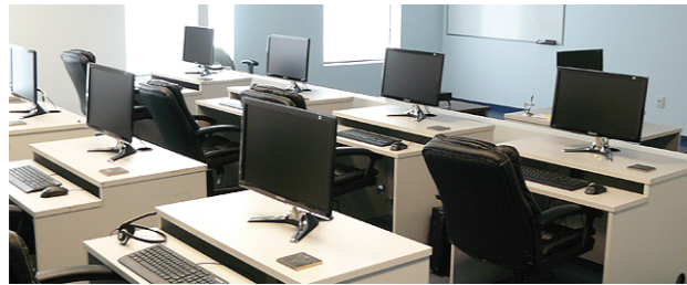
IDS training facility. Sherwood Park, AB

IDS provides a full compliment of training programs. From on-site training with fully qualified trainer's, to client specific training manuals, IDS training programs are clear and organized to help make the transition to Instrumentation Databases as simple as possible.